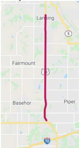
Wyandotte & Leavenworth counties

KDOT urges all motorists to be alert and obey the warning signs when approaching and driving through a highway work zone. To stay aware of all road construction projects across Kansas go to www.kandrive.org or call 5-1-1. Drive safely and always wear your seat belt.