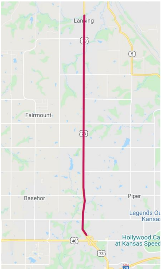
Wyandotte and Leavenworth counties